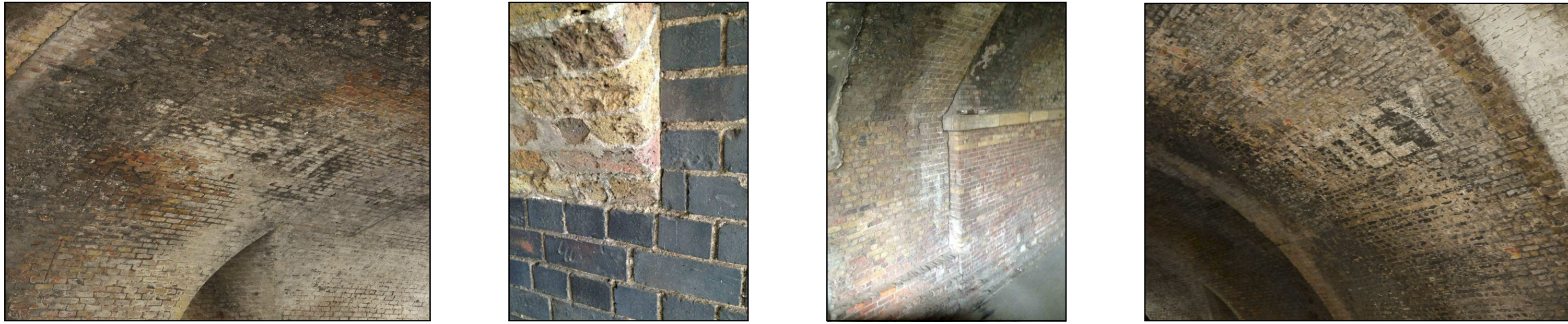
AS MUCH AS POSSIBLE OF THE EXISTING PATINA THAT CHARACTERISES THE EXISTING ARCHES AND VAULTS TO BE MAINTAINED IN THE NEW DEVELOPMENT.